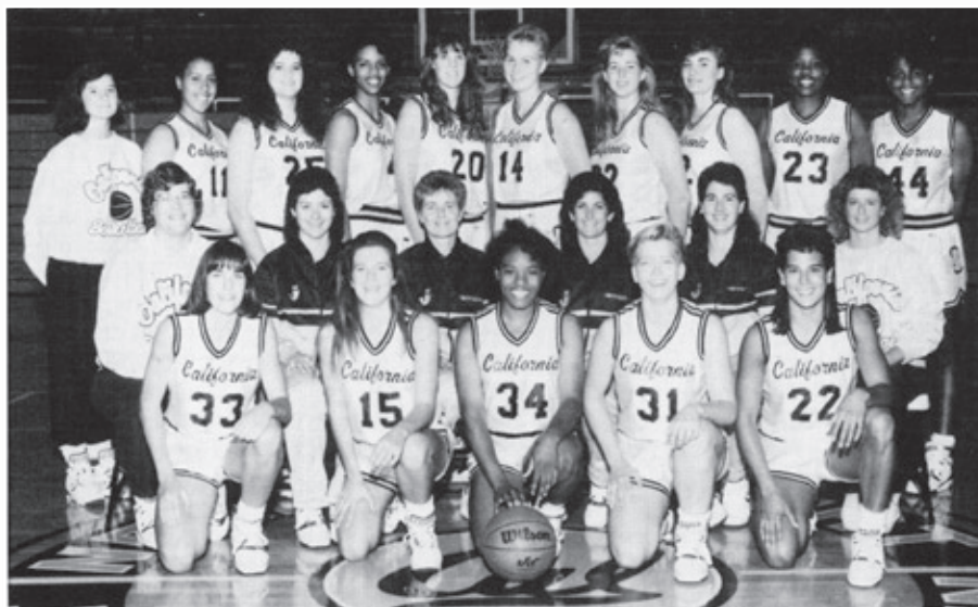
1989-90 NCAA TOURNAMENT QUALIFYING TEAM

Halftime: Cal 47, LBSU 43. FG%: Cal 50.0, LBSU 43.1. 3P%: Cal 28.6, LBSU 0.0. FT%: Cal 70.0, LBSU 77.5. Officials: Broderick, Barribeau. Technical Fouls: none. Attendance: 662.