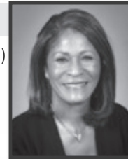
C. Vivian Stringer