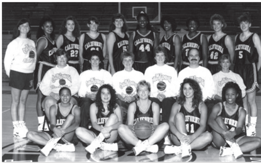
1991-92 NCAA TOURNAMENT QUALIFYING TEAM