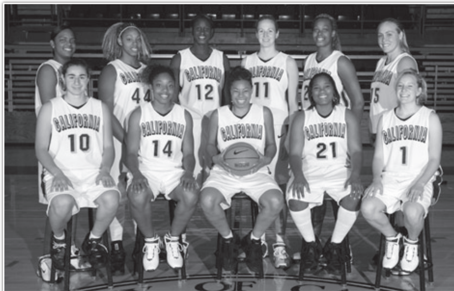
2006-07 NCAA TOURNAMENT QUALIFYING TEAM