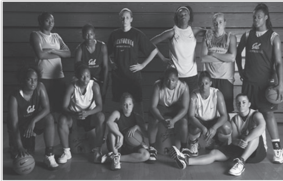
2005-06 NCAA TOURNAMENT QUALIFYING TEAM