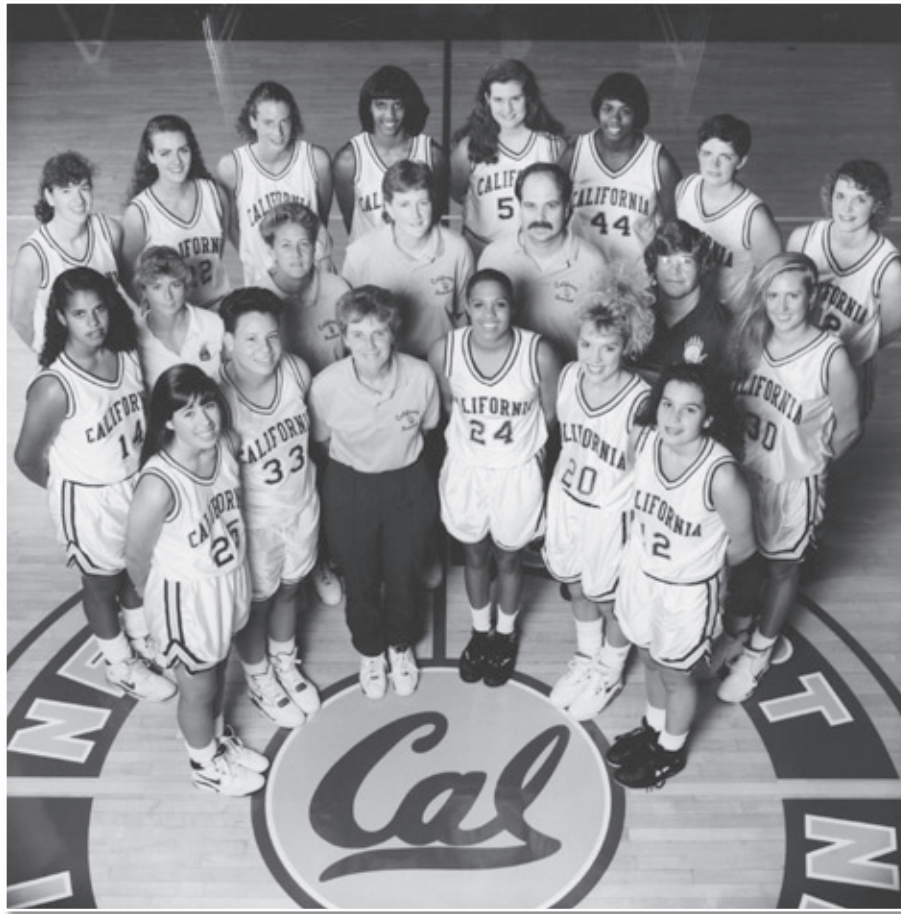
1992-93 NCAA TOURNAMENT QUALIFYING TEAM

Halftime: Cal 22, Vanderbilt 40. FG%: Cal 39.7, Vanderbilt 59.6. 3P%: Cal 20.0, Vanderbilt 66.7. FT%: Cal 77.8, Vanderbilt 58.8. Officials: Fuzimoto, Geiselman. Technical Fouls: none. Attendance: 2304.