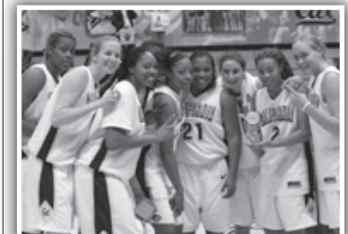
Cal Women's Basketball Team 2006 Tournament Champions